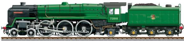
BR Standard Class 6 72010 'HENGIST'