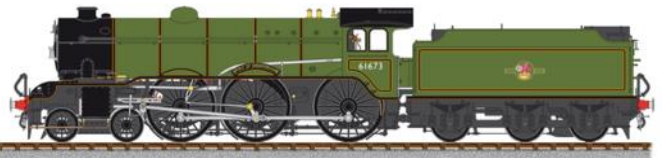
LNER B17 61673 'Spirit of Sandringham'

We are delighted to announce that we are able to welcome visitors to view the continuing construction progress of two previously scrapped classes of steam locomotives.